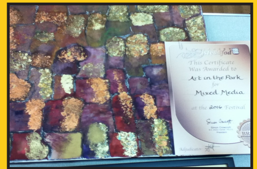
Art in the Park Mixed Media Bronze award.

We have seen our numbers increase at the classes on Tuesday afternoons at All Saints Hall and we had a great time at the Eisteddfod this year.