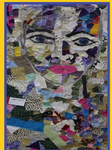
Art in Park Gold Award