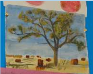
Some of the work produced—including above, a first time attempt