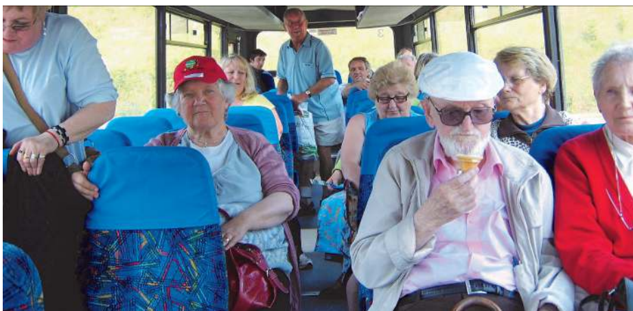
The Island Trip and Barbecue at Reg's Garden