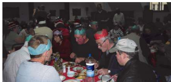
The Christmas Party 2011