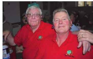
Q-What happens when a Reverend and a Baptist get together????