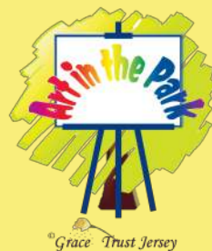
New logo designed by Christine Le Breton